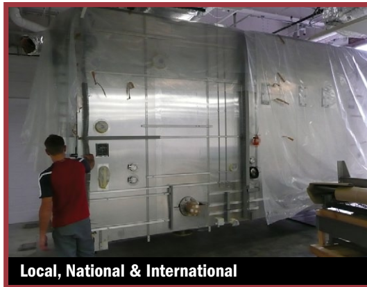
Local, National & International

MEI has the equipment, experience and personnel capable of handling all of your industrial and commercial hoisting, rigging and machinery moving needs, including crane rental and transportation coordination. MEI has moved machine shop equipment involving CNC mills and lathes, relocated hydraulic presses, and moved complete manufacturing and packaging lines, including an 84,000 pound glass inspection line and a 38,000 pound pharmaceutical sterilizer.