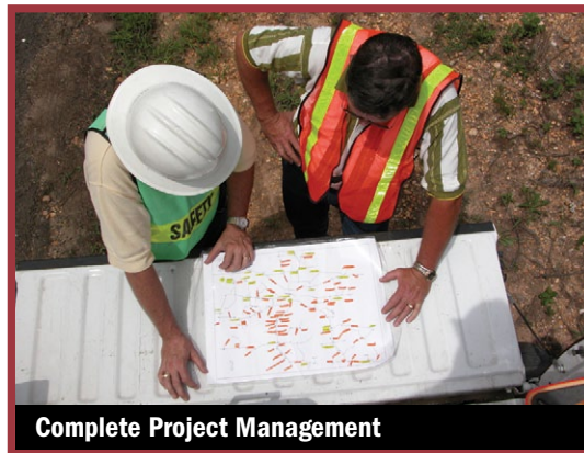
Complete Project Management

MEI has the experience and support services capable of providing a one-stop solution for coordinating your equipment moving needs whether your project involves just a local equipment move, or requires rigging, removal, crating, transportation or export shipping, unpacking and re-installation. In addition to rigging, hoisting, moving and crating services, we provide air, land, and ocean freight coordination; consolidation, loading, and forwarding services; storage facilitation; export documentation and shipping; ordering, blocking, and bracing of ocean containers; Dangerous Goods Declarations for IATA, ICAO, IMDG, and US DOT.