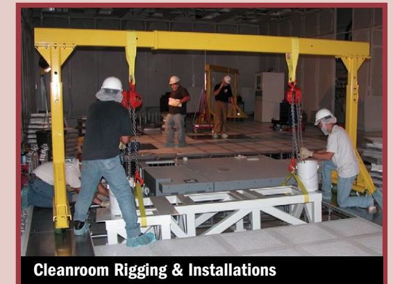
Cleanroom Rigging & Installations

MEI Rigging and Crating's teams are trained and experienced in all of the cleanroom specialized services and protocols including contamination, safety, ergonomics, tool/materials cleanliness and hazards/emergency procedures. We provide excellent protection of surrounding facilities during a move. Additional services for cleanroom equipment relocations include custom pedestal and seismic anchors (restraints) manufacture and installation, and raised metal floor fitting and installation services.