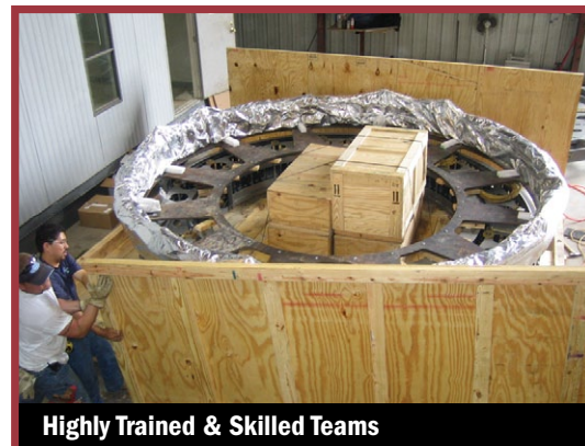
Highly Trained & Skilled Teams