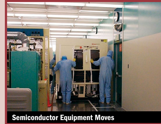
Semiconductor Equipment Moves

MEI has more than 18 years of experience in rigging, crating and installing semiconductor process equipment. We are experts in cleanroom and semiconductor equipment moves, and provide services for many of the top semiconductor, MEMS and medical device manufacturers. Our highly trained crews are aware of the contamination, vibration and condensation issues associated with micro-fabrication equipment, and have the specialized crate designs and equipment including cushioned decks, air skates, cleanroom dollies and Rol-A-Lifts to safely and securely handle sensitive machinery.